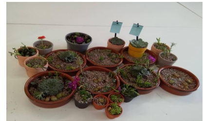
Examples of recent craft activity.

This month we will be marbling card. All equipment will be provided. Cost is £1 (and you will need money to purchase any hot drinks or food from the café).